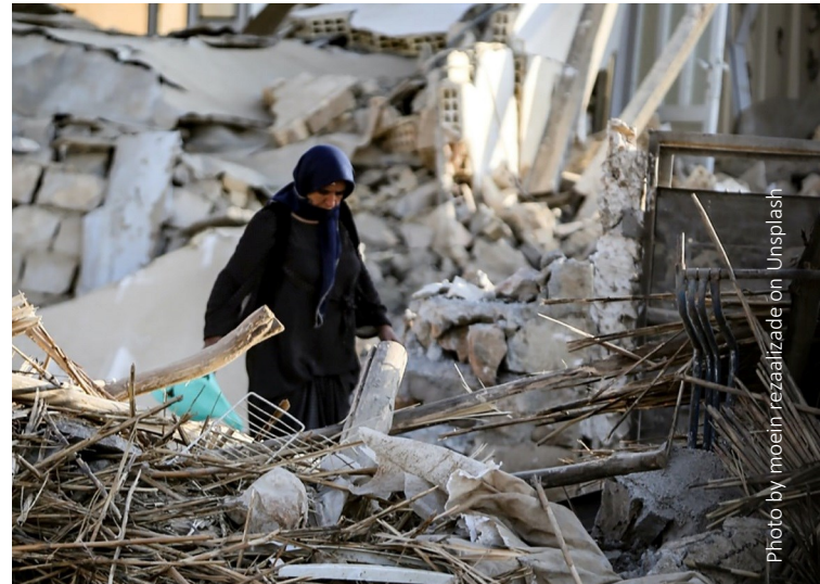
Praying for our brothers and sisters in Turkey and Syria.

Consequently, it is at this moment of great difficulty which causes fear, that most powerful and generous nations and individuals show their solidarity, love, and compassion with the people in need who have been greatly impacted in the wake of the earthquake or storm. In as much as we feel terrified for what havoc the earthquake has caused on peoples' lives and properties, it offers us an opportunity to glorify the God of heaven and earth (Rev. 11:13).